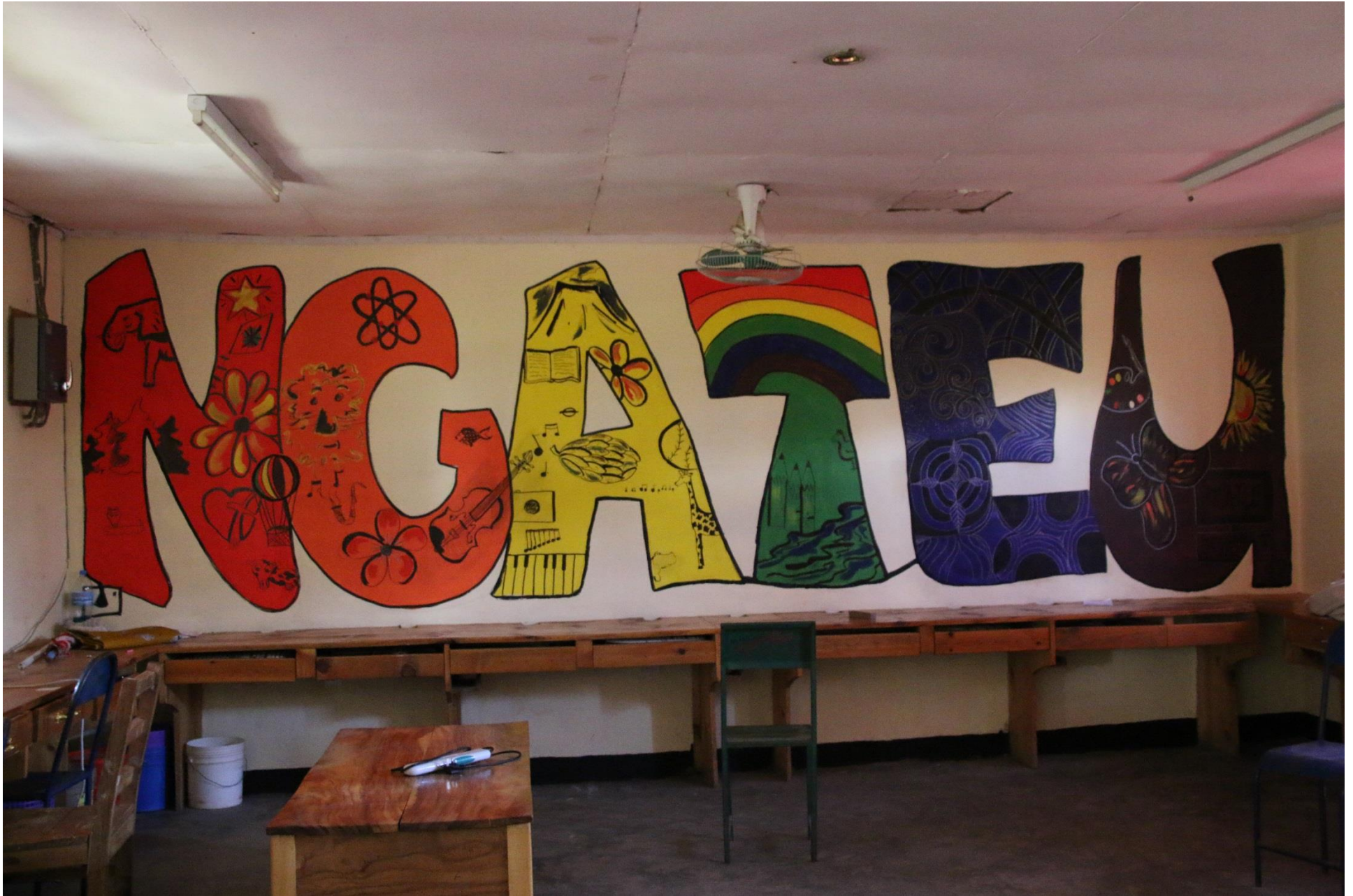
Kwisha - Finished