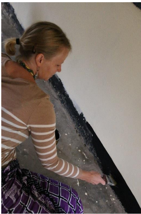
^Jenn cutting in a clean line.