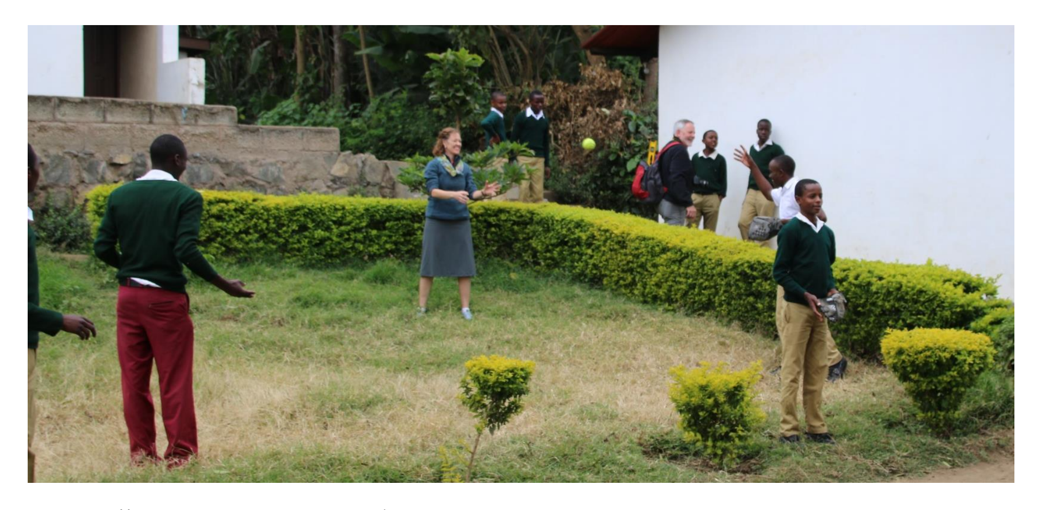
Baseball practice at Ngateu!